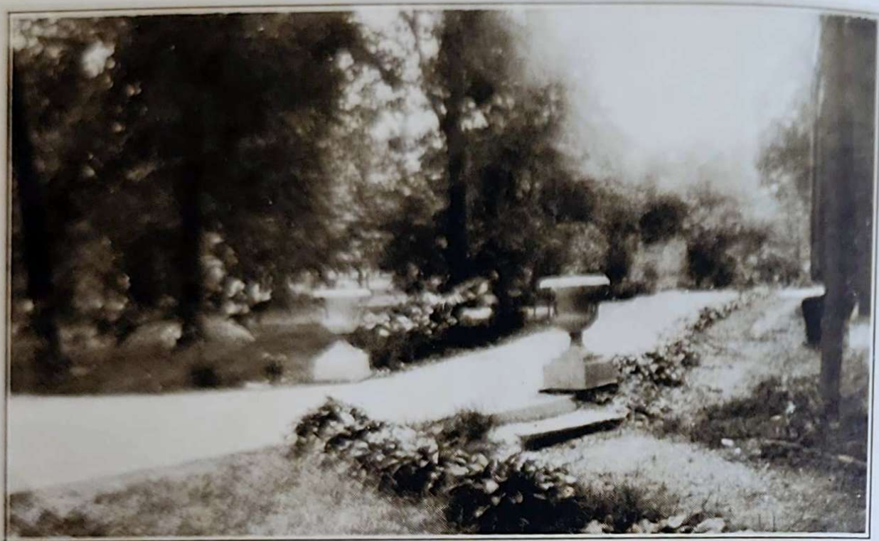
To the Grotto.