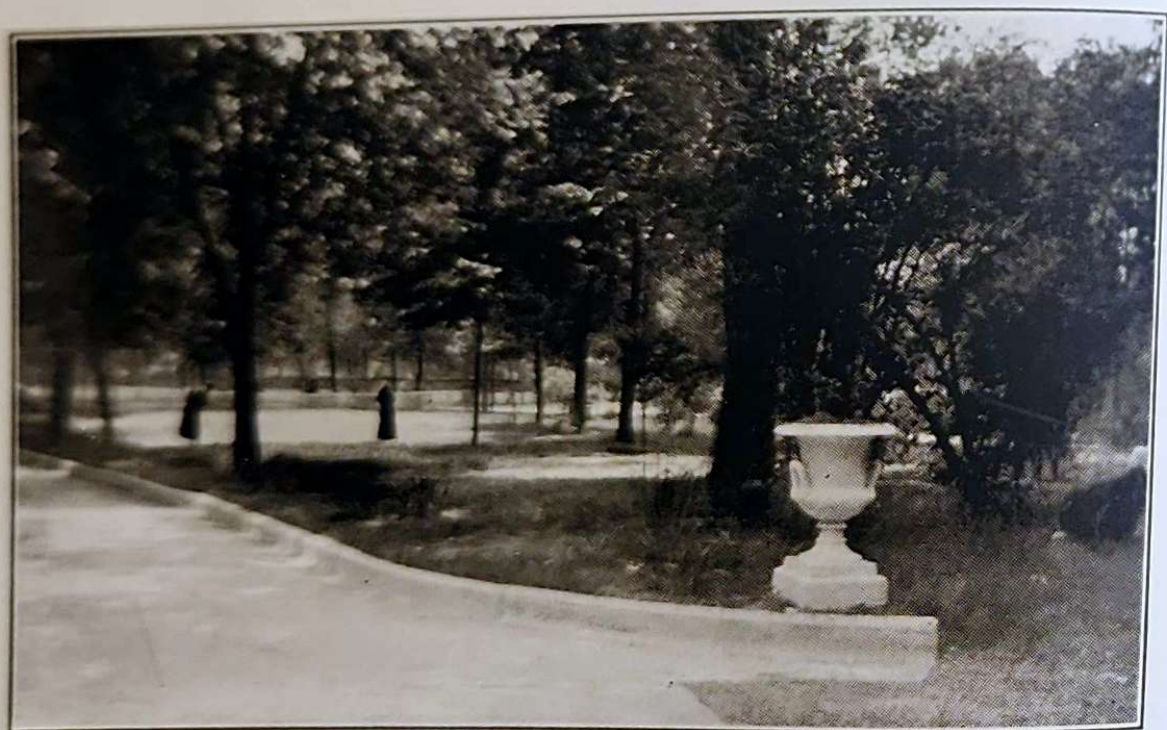
Views of Tennis Courts.