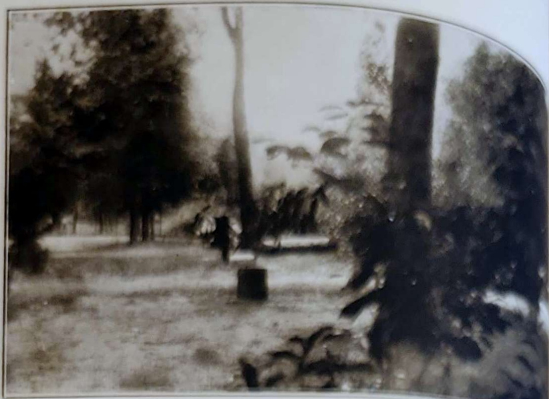
South View of Playgrounds.